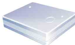
Sealed Styrofoam® Container (1-inch-thick minimum)

For Biological Substance Category B (UN 3373), enclose an itemized list of contents between the secondary packaging and the outer packaging. For liquids, the secondary packaging must be leakproof; for solids, the secondary packaging must be siftproof. These illustrations below are not intended to represent secondary containers for Biological Substance Category B (UN 3373). Secondary containers for Biological Substance Category B (UN 3373) must be certified by the manufacturer prior to use.